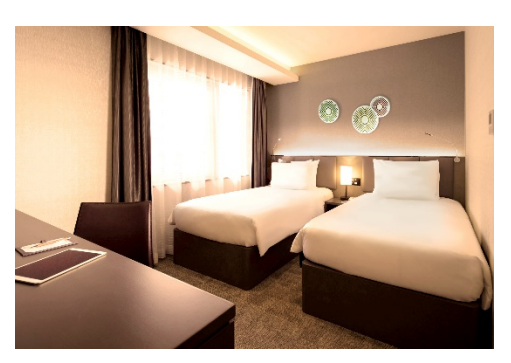
Hotel Type Guest Room*